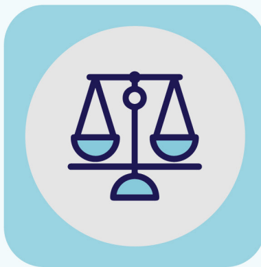
Step 2 RISK ADJUSTED WEIGHTS

Each day, a further mechanism is implemented: