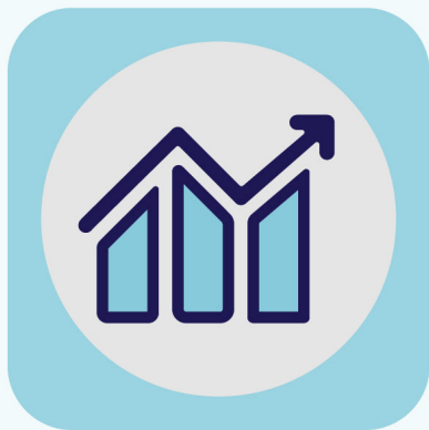
Step 1 MOMENTUM

The index has a 3-step rebalancing process built upon key financial concepts.